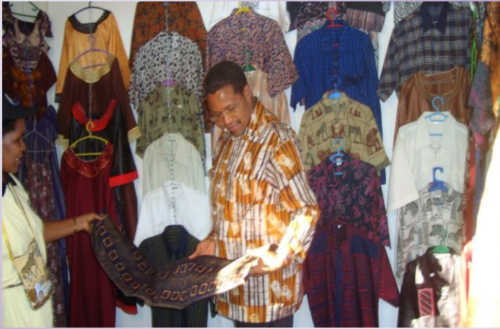
His Excellency, Dr. Jakaya Mrisho Kikwete, the President of the United Republic of Tanzania admiring a batik material when he visited the NEEC pavilion.

The entrepreneurs acknowledged that the NEEC was doing a tremendous job in supporting their participation in the exhibition as majority could not afford exhibition costs. They made a call to the NEEC to continue with the effort to host more entrepreneurs in future exhibitions as a way of creating more exposure to entrepreneurs in terms of learning new innovations and opportunities for