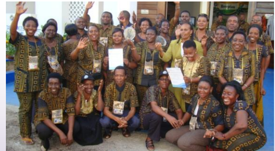
Entrepreneurs and NEEC Staff celebrating with their trophies as the Overall and Category winners of the 36th Dar es Salaam International Trade Fair.