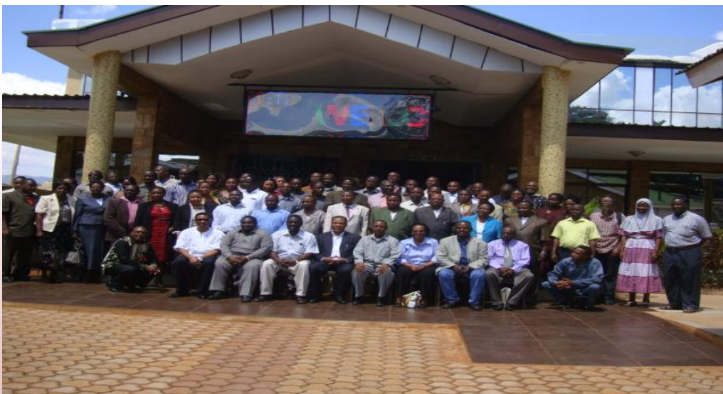
Group photo of the participants of the Stakeholders Meeting of the Entrepreneurship education system delivery coordinated by ILO from District and Regional Education officers under Ministry of Education and Vocational Training in Morogoro.

collaboration with the Ministry of Education and Vocational Training (MoEVT) to introduce and strengthening delivery of Entrepreneurship Education in formal and non-formal education system in the country.