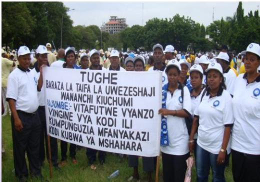
Staff of NEEC Secretariat taking part in the celebration of Workers Day 2012 at Mnazi Mmoja Ground.