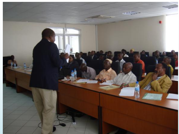
Participants of the Training to empower local carpenters to access public tenders organized by NEEC listening to the one of the Facilitator of the Training.

Carpentry is defined as an art or skills in working with wood to construct install and maintain buildings, furniture, and other objects. A carpenter is a skilled craftsman who constructs things out of wood such as structures and pieces of furniture (Carpentry Guide 2006 – 2010). In our life experience it has been observed that it is difficult to find a human being living without using carpentry products. Carpentry products are commonly found in public and private offices, residential houses, restaurants, bars, classrooms,