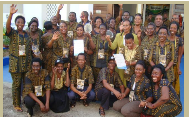
The NEEC staff and entrepreneurs celebrating with their trophies the Overall and Category Winners of the 36 th Dar es Salaam International Trade Fair.

The National Economic Empowerment Council (NEEC) was participating in the exhibitions for the third time. The NEEC was assessed to have met the international judging criteria for the exhibitions and emerged the Overall Winner of the exhibition and the first Winner